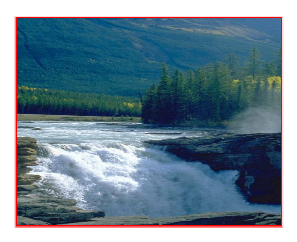
The Lord's Lessons In Nature

Let's learn the first lesson of the waterfall and praise God for all He has done for us now and for all eternity.