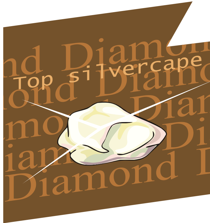
A rough diamond

Unlike many of the other things in these stories, the diamond is not something you will see laying around in your neighborhood. You can, however, easily get to see a diamond since many people wear them in jewelry. You can also visit a jewelry store and see many diamonds on display.